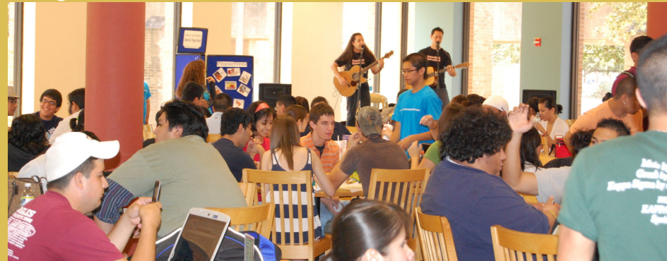
Music at the Union