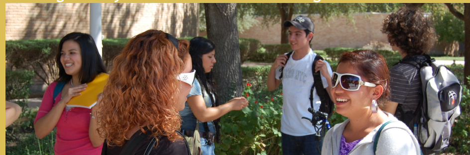
Running Into Friends

If you know someone that is doing something wrong thinking he is right, how can you tell that person without that person getting mad?