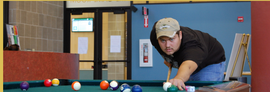
Going for the Green